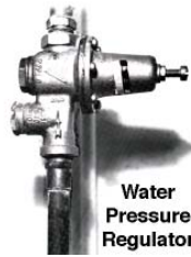
Water Pressure Regulator

Thermal expansion tanks come in several sizes and must be fitted to the water pressure of the line and the volume of your hot water tank. Installation is not difficult.