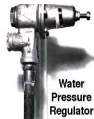
Water Pressure Regulator

Another safety device to protect you from high water pressure is the temperature-pressure relief valve . The T-P valve, usually found on the side of the water heater near the top, is designed to open when pressure or water temperature rise above safe levels,