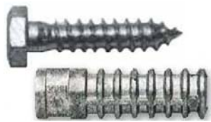
lag screw and shield

For medium-weight items, use lag bolts and shields that expand in the wall. They grab into the hole better than regular anchors (which tend to be smooth), but require that you drill a hole (at least 1/2" diameter) that will hold the shield snugly. Make sure the bolt is long enough to go through the item being mounted to the wall and extend slightly beyond the end of the shield to expand it fully. The shield should be about 2" to 2-1/2" long.