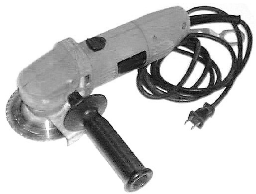
4-1/2" angle grinder w/ diamond masonry blade

If the bell-shaped tile hub where you insert the clean out has broken away, you have a couple of options. The first is to dig down to the next hub joint, remove the broken piece, and purchase a replacement tile pipe at a building supply company. Should the new piece of clay tile pipe be too long, cut it to length outside with a concrete saw or an angle grinder with a masonry cutter blade. Connect the new pipe to the next one with a rubber gasket (purchase it where you buy the replacement piece), or you can mortar it in place; then, mortar the PVC wye into the new hub.